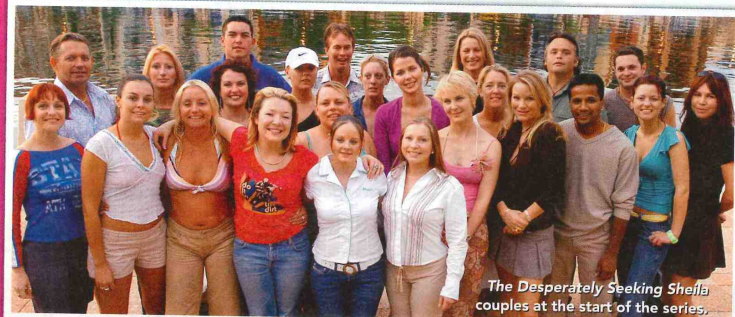
The Desperately Seeking Sheila couples at the start of the series.

● Desperately Keeping Sheila screens Tuesday, July 3, 7.30pm on SBS.